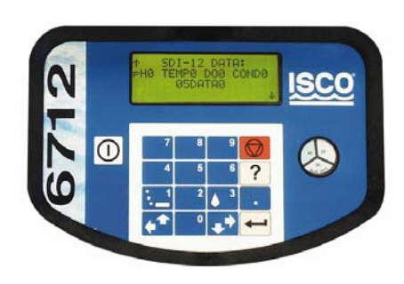
The 6712 Controller is also an SDI-12 data logger, and has many optional capabilities. Please contact Isco or your Isco distributor for more information.

E-Mail: iscoinfo@teledyne.com Internet: www.isco.com